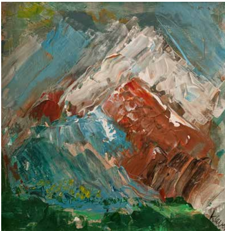
“Mountains for Chenega” - a painting by Sandra Kleven

There are mountains that surround me That speak of so many things Like how they got there, what resides amongst the trees and boulders that flank its surface How beautiful they shed their winter coats And provide for so much life! Occasionally, if you are lucky, you can enjoy how slowly they undress themselves When a sheath of fog rolls off its surface And the sun lights up its face! There is something majestic how they leave you In awe as you gape at their beauty! Bears, deer, porcupine and birds of the smallest To the magnificent eagle will find refuge in its coat of many trees! Mountains seem to nestle you in And shelter you from the windiest, coldest and hottest elements of the seasons. They provide you a cloak from that arrow that turns off your light They extend their arms for nests for new birth And they give you seasons of health! So, because mountains are so significant Identify with them Make them come alive for you Call them Mt. Superior, Mt. Guardian, Mt. Funnyface! Anything... Just make them known to you.